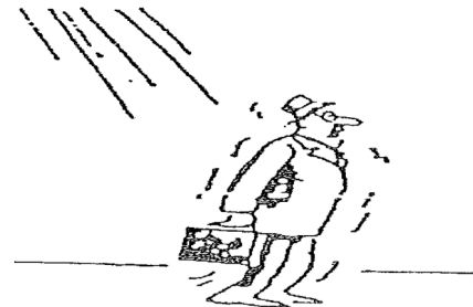
"This is the Lord speaking"