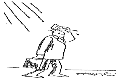
"Have a nice day"