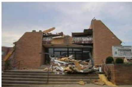
First Presbyterian Church in Cambridge, Ohio, following straight line winds in 2012.