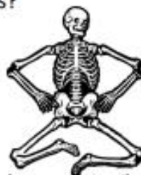
bones came together