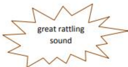
great rattling sound