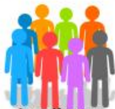
together as a nation