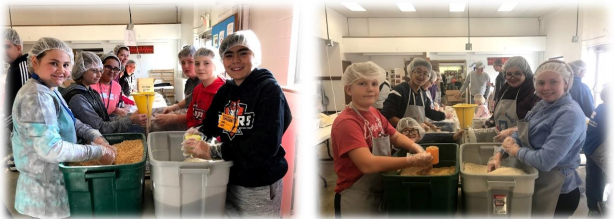
Hastings Middle School Students Home School Students

“But be doers of the word, and not hearers only, deceiving yourselves.” James 1:22