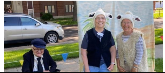
(Above) 3 of our many volunteers (Left) VBS Kiddos and Volunteers singing