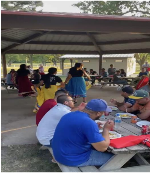
Welcome Picnic for Seasonal Workers