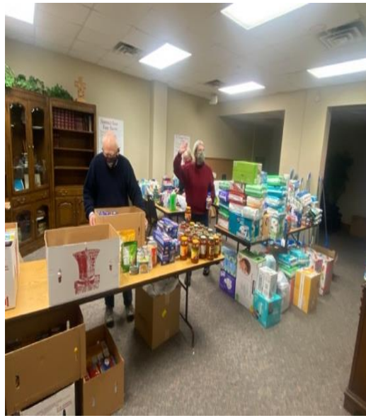
Reverse Advent Donations