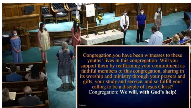
Confirmands joining the church on May 2,

We adapted our Confirmation Curriculum to be taught in a condensed format and held classes on Wednesday evenings from February through April. This worked well and we confirmed six of our eighth graders as new members of the church on May 2. It was a joyful celebration! Thank you to our confirmation teachers and sponsors, and to our confirmands and your families for your flexibility. It was inspirational to work with these young people and hear them profess and share their faith.