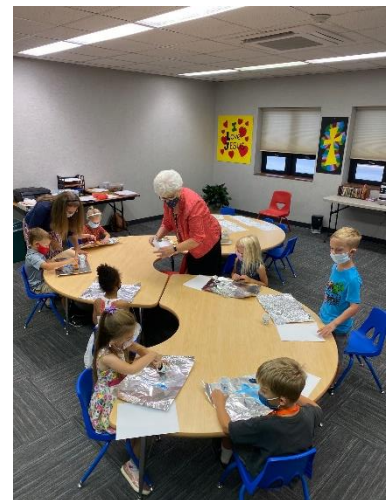
(Left) Outdoor Choir rehearsal (Right) Sunday School In-Person