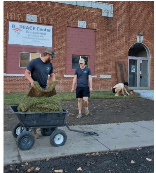
New Sod and Sprinklers installed