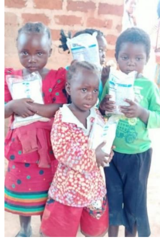
Children in Zambia Receiving Food