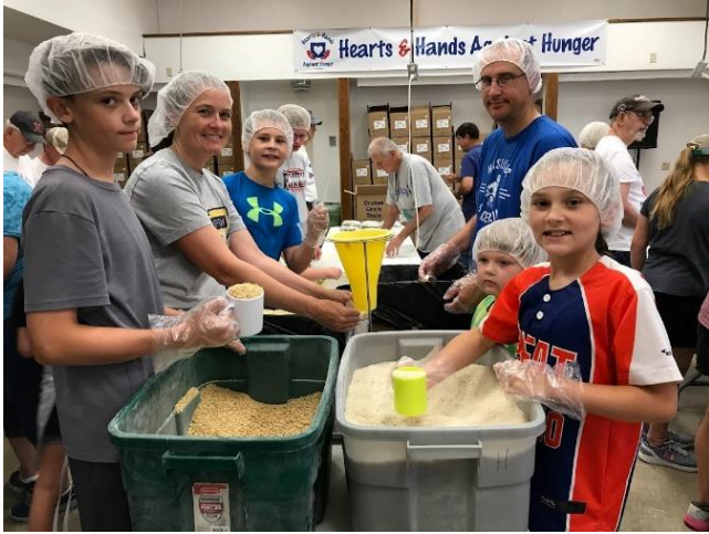
Family Packing Meals