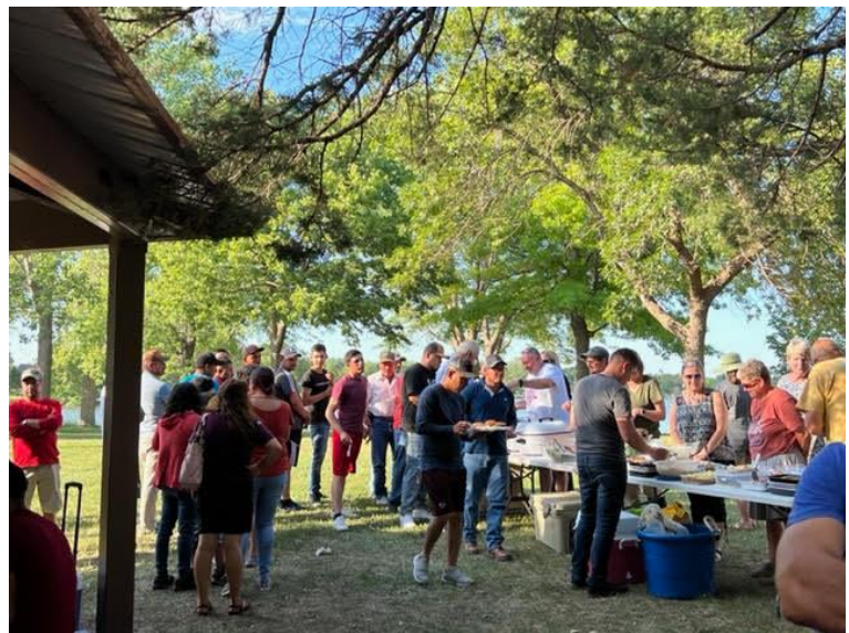
Welcome dinner for migrant farm workers