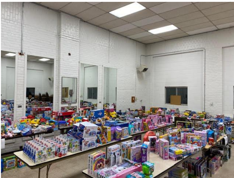
Toys for Tots at Peace Center