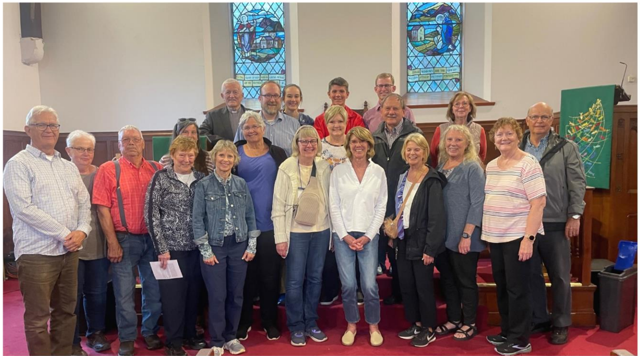
21 Spiritual Pilgrims from Hastings, Nebraska. Members and friends of First Presbyterian Church of Hastings.

The group of 21 spiritual pilgrims from First Presbyterian Church of Hastings has returned safely to Nebraska, but I believe we left part of our hearts in Portree with our sisters and brothers in Christ at the Portree Parish Church. We are still basking in the joy that we shared with you on Wednesday, June 21. Thank you for the warm welcome that you offered to us at the concert and afterwards as we shared cookies, coffee, tea, and fellowship with you. Your gracious hospitality made us feel like we were part of your family of faith, and our spiritual pilgrims from Nebraska continue to reflect fondly on the time we spent together, with our only regret being that we couldn't spend more time together and share a Lord's Day service with you on Sunday.