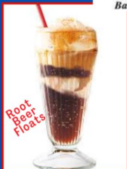
Root Beer Floats