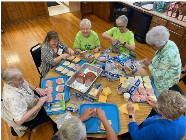
Open Table sack lunch packing (July, 2023)