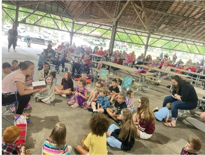
Pentecost Worship Service in Chautauqua Park (May, 2023)