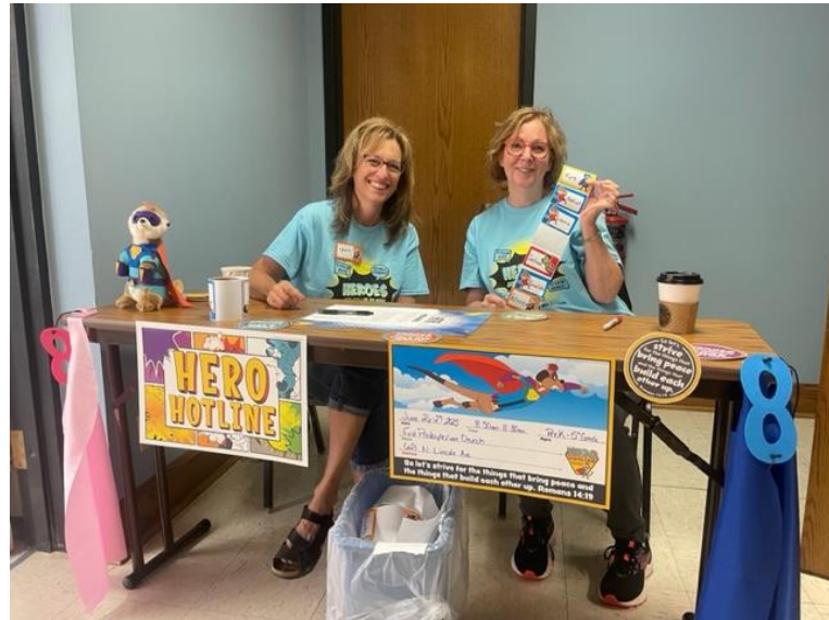
Vacation Bible School (June, 2023)