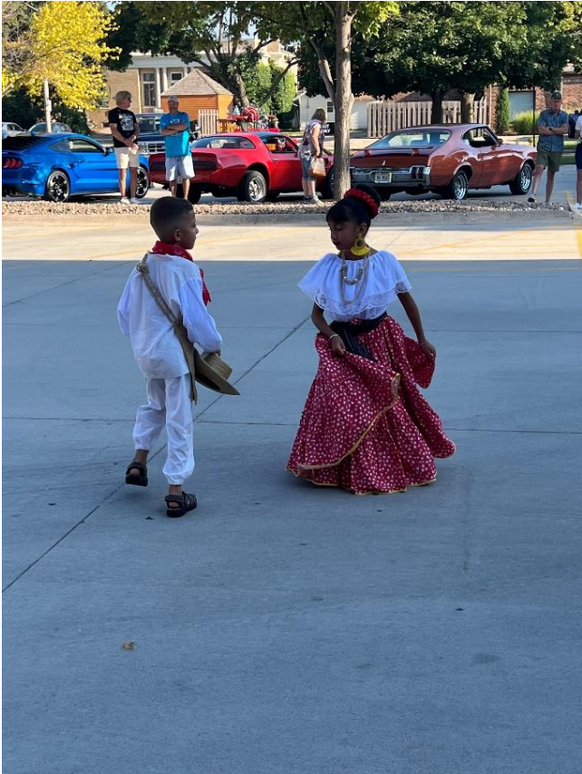
Car Show (July, 2023)