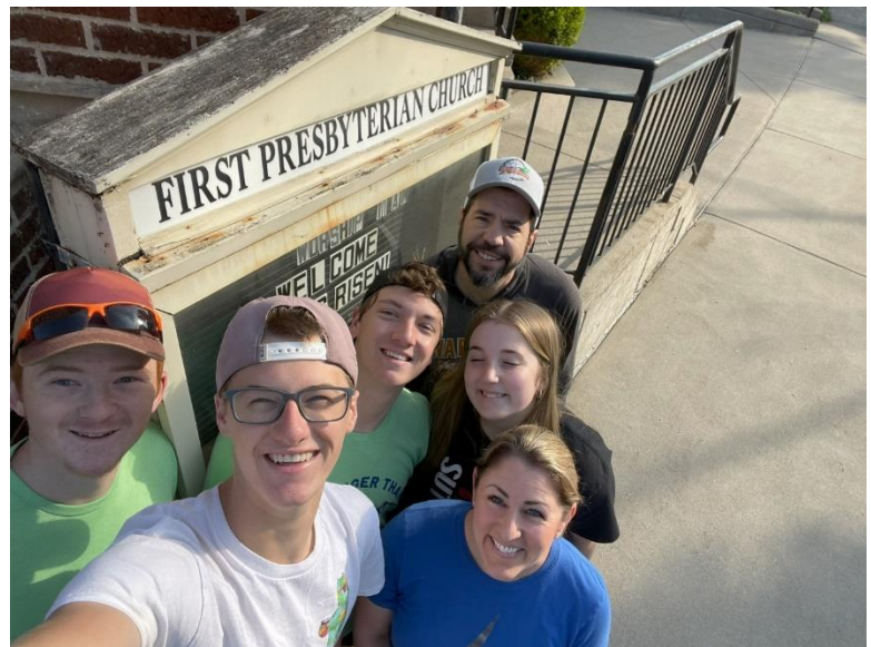
Go & Serve youth mission trip-Hazard, Kentucky (June, 2023)