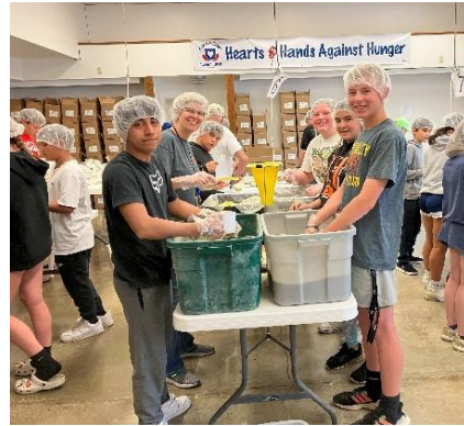
Hastings Middle School 7 th Graders

Last year, 2186 Hearts & Hands volunteers packed over 793,456 meals at the First Presbyterian PEACE Center. These meals filled five semi-trailers. With the help of Orphan Grain Train, these meals were shipped to 18 countries and to many hungry people in the United States. Orphan Grain Train frequently gets thank you letters from the organizations receiving the food. A school in Liberia recently wrote: