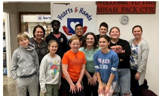
First Presbyterian Youth Group