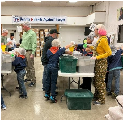
Cub Scouts & Parents, Pack 207