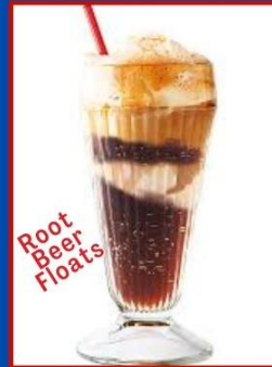
Root Beer Floats