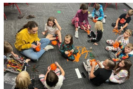
(Pictured Right: students participating in Pumpkins & PJ’s)

In October, we held an event called “Pumpkins and PJ’s”. This was a three hour event for students on a Saturday night, designed to let parents have a night out. We shared a meal, watched a movie about trusting God when we are scared, made a craft, did a couple of science experiments, played some games, and decorated cookies. We had a great night with twenty students and six volunteers!