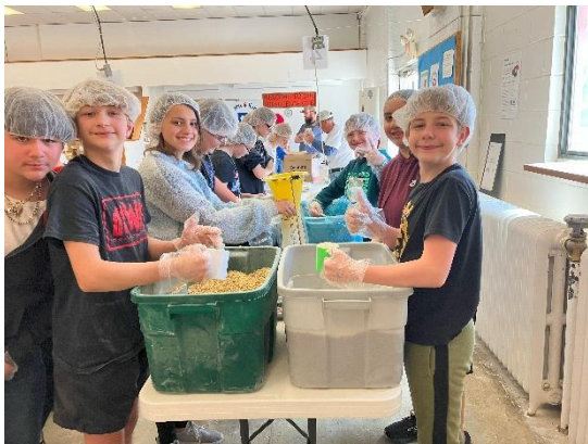
Hastings Middle School 7 th Graders