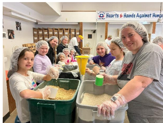
Brownie & Girl Scouts and Leaders

Girl Scouts, Cub and Boy Scouts, 4-H Clubs, Grade School Classes, Middle and High School Classes, National Honor Society, College Groups, Church Youth Groups have all come to pack meals at the Presbyterian Church Peace Center during the last year. The 1500 volunteers packed over 500,000 meals at the Peace Center in 2024.