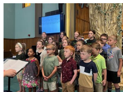
(Pictured above and below: various students and volunteers at VBS)