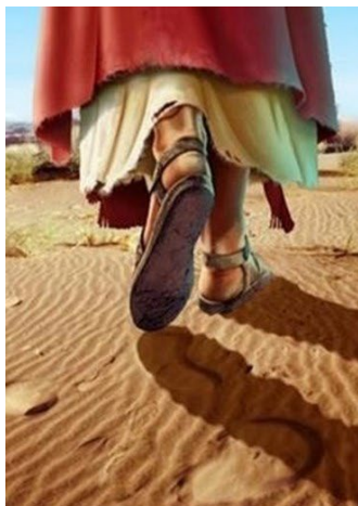
Journey to the cross... A Lenten Sermon Series