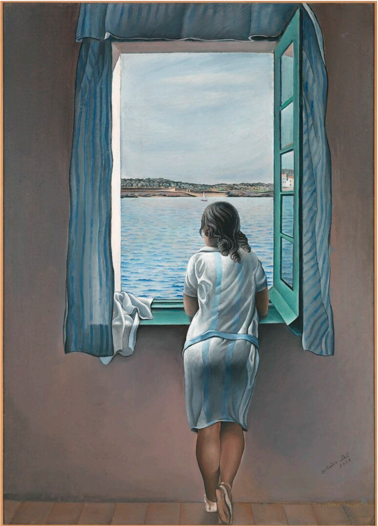
"Young Woman at a Window" by Salvador Dalí 1925 Oil on paper