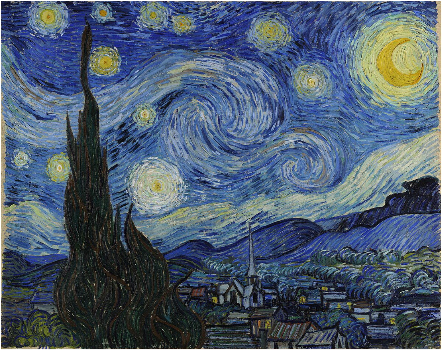
“The Starry Night” by Vincent van Gogh 1889 oil-on-canvas