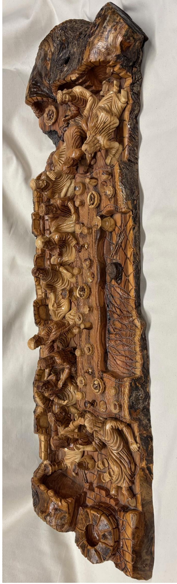
Olivewood sculpture carved by Palestinian Christian artist in 2019