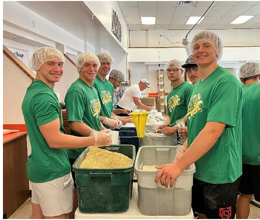
Sertoma 8 Man Football Camp