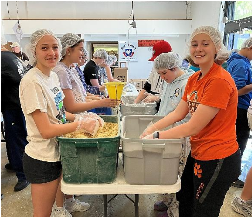
Hastings Middle School Eighth Graders